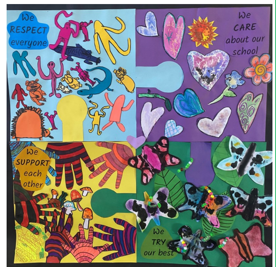
Our Euroa Show entries